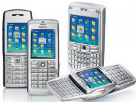
Nokia E50, E60, E61/E62 & E70

BLACKBERRY CONNECT is a service similar to Integral. We must install BlackBerry Connect client has to be installed on the mobile phone. Client on mobile phone is connected to the Relay server. You can use (BES or BIS service)