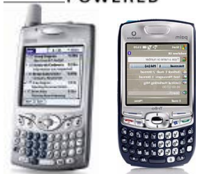
Palm Treo 650 & 750