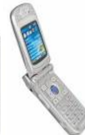
Motorola MPx220 & Q