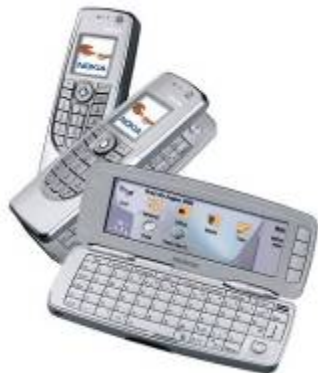
Nokia 9300, 9300i & 9500